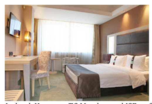
The teams that are housed in the hotel Holiday Inn are: Ireland, Hungary, TC Member and ISF staff.